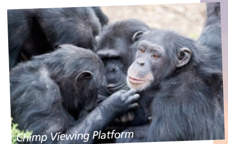
Chimp Viewing Platform

Capacity: 50 guests for a cocktail style event.