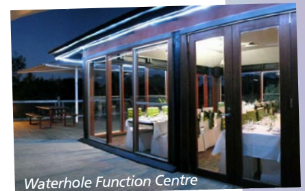
Waterhole Function Centre

Capacity: 100 guests seated or 220 guests for a cocktail style event.